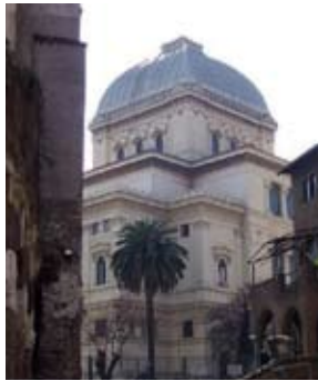
Rome's Temple Maggiore